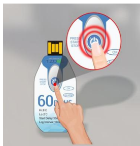
Press the button to start