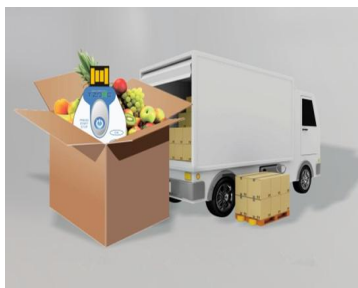
Put into the box / carton